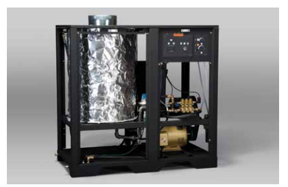
Fully instrumented, the ENG's removable panels allow easy access to components.

If you're tight on space but have big cleaning needs, Landa's patented* ENG is the perfect machine for you! There isn't a more compact natural gas pressure washer on the market. The ENG packs a ton of features into an incredibly tiny footprint. Start with Landa's patented Cool-Bypass** system that keeps the water temperature low while the machine is in bypass mode, extending the life of the pump. Other innovative features include Landa's Tru-Tite belt tensioning system, which relies on a spring-loaded idler arm to keep the belt aligned and tensioned, reducing wear and tear on the belt; and the Fielder's Choice system, which allows you to switch the inlet/outlet connections from one side to the other, adding versatility and making installation a breeze.