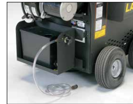
Optional rust-free Float Tank with stainless steel inlet filter, backflow protection and inlet detergent metering valve (8.917-506.0).